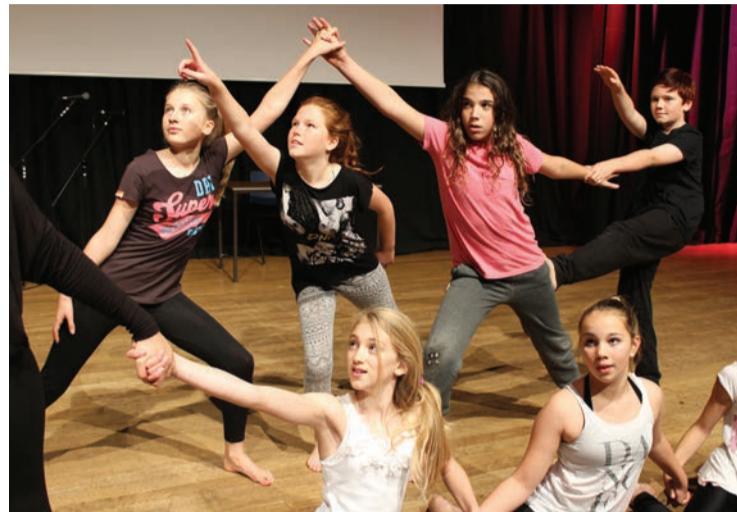
Year 7's focus was on Health and Well-being, with sessions on healthy eating, relationships and getting active.