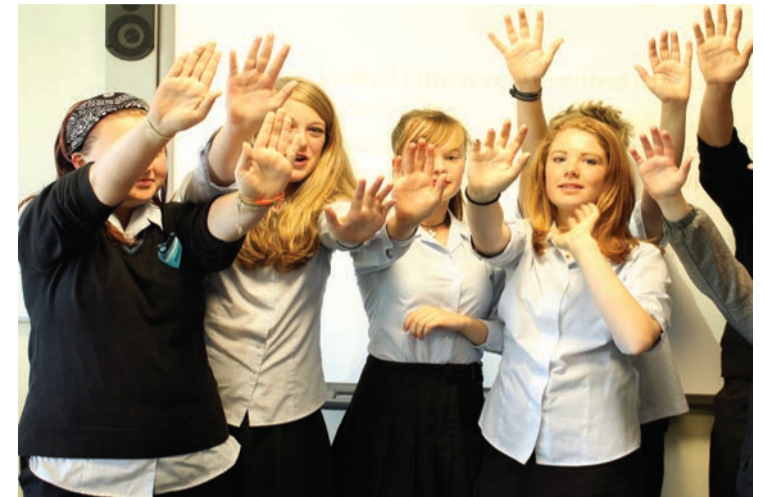
Year 9 began the KEVICC Stand Up To Hate campaign that it's intended will run across all year groups in the College.