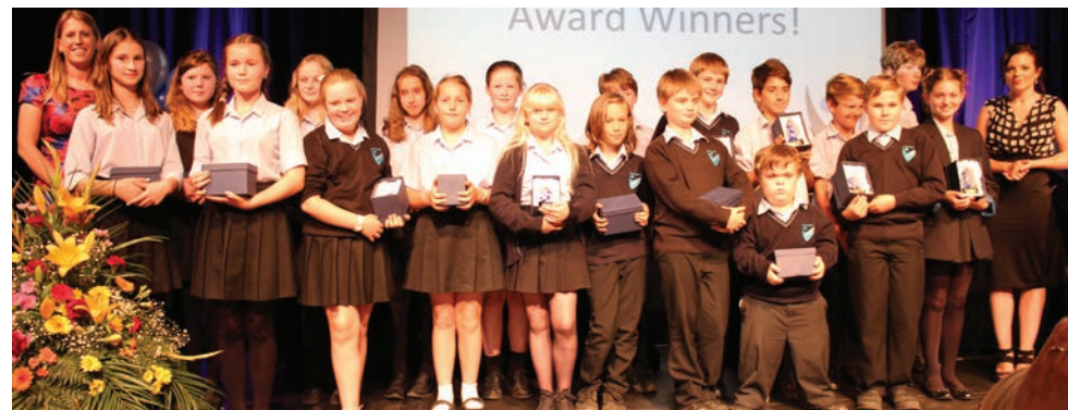
Year 7 Achievement Evening Group