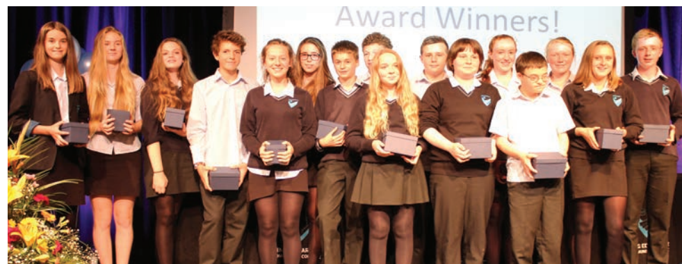
Year 9 Achievement Evening Group