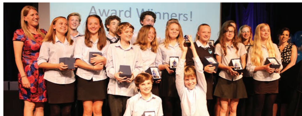
Year 8 Achievement Evening Group