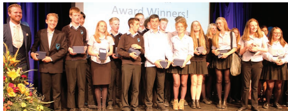
Year 10 Achievement Evening Group