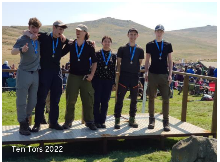
Ten Tors 2022