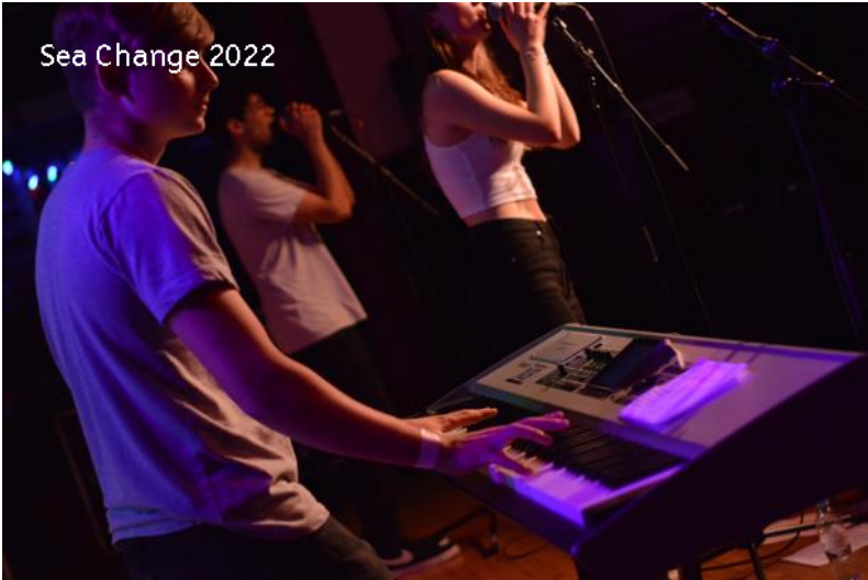
Sea Change 2022