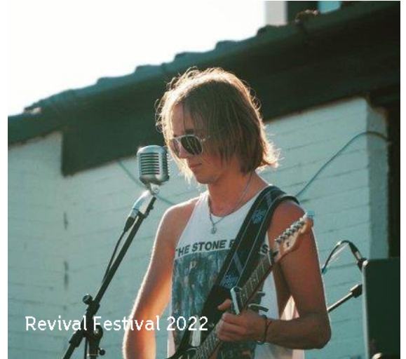
Revival Festival 2022