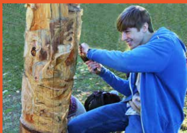
Kennicott students had the opportunity to work with a visiting professional, using woodworking tools, and carved a totem pole in the Kennicott garden