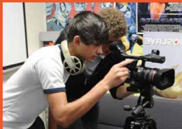
Film students undertake many practical projects both in, and out, of the College