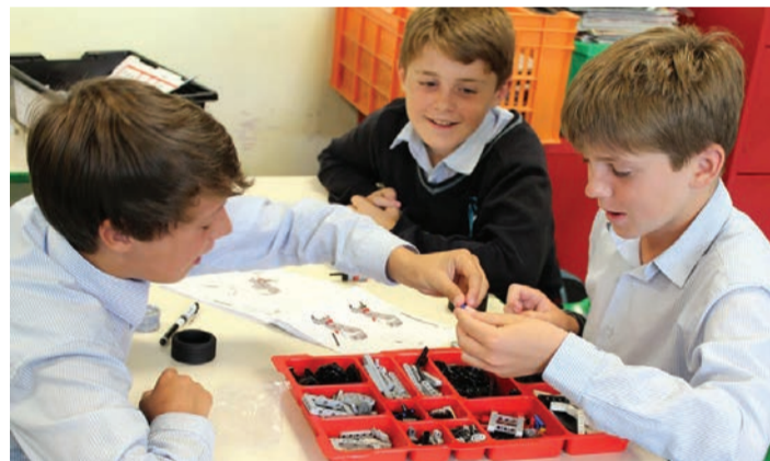
The Lego robotics kits (a successful teaching tool) were funded by the Foundation Governors as part of a £6000 bid to provide Maths equipment.