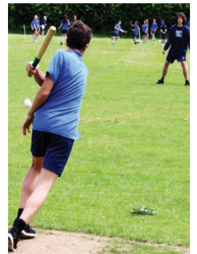
Year 9 play All American Baseball