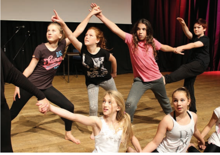
Year 7's focus was on Health and Well-being, with sessions on healthy eating, relationships and getting active.

The Stop Hate Campaign and working with the Totnes Neighbourhood Plan were some of the areas explored on the KEVICC's Curriculum Enrichment Day.