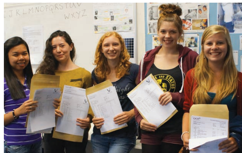
Kennicott students receiving their exam results

This year's exam results at GCSE and A level build even further on last year's record breaking achievement of students.