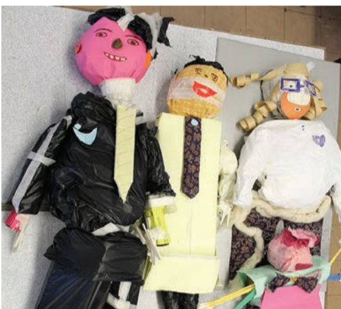
Junk Sculptures of favourite teachers