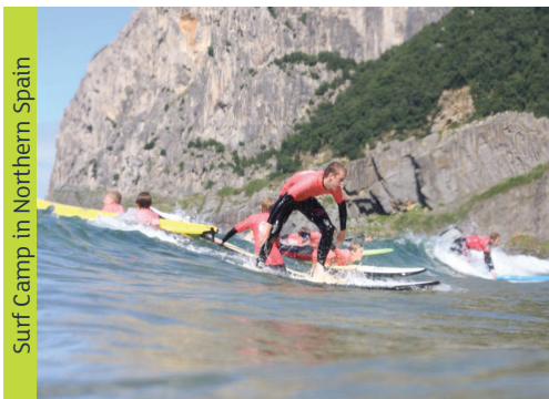
Surf Camp in Northern Spain