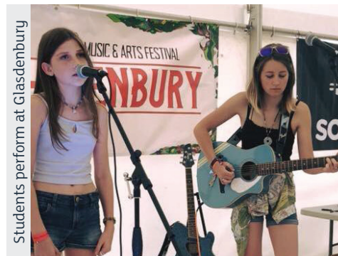
Students perform at Glasdenbury