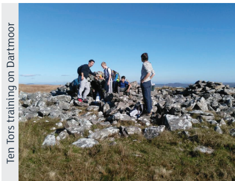
Ten Tors training on Dartmoor