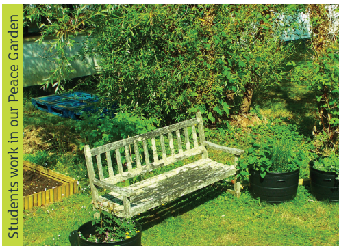
Students work in our Peace Garden